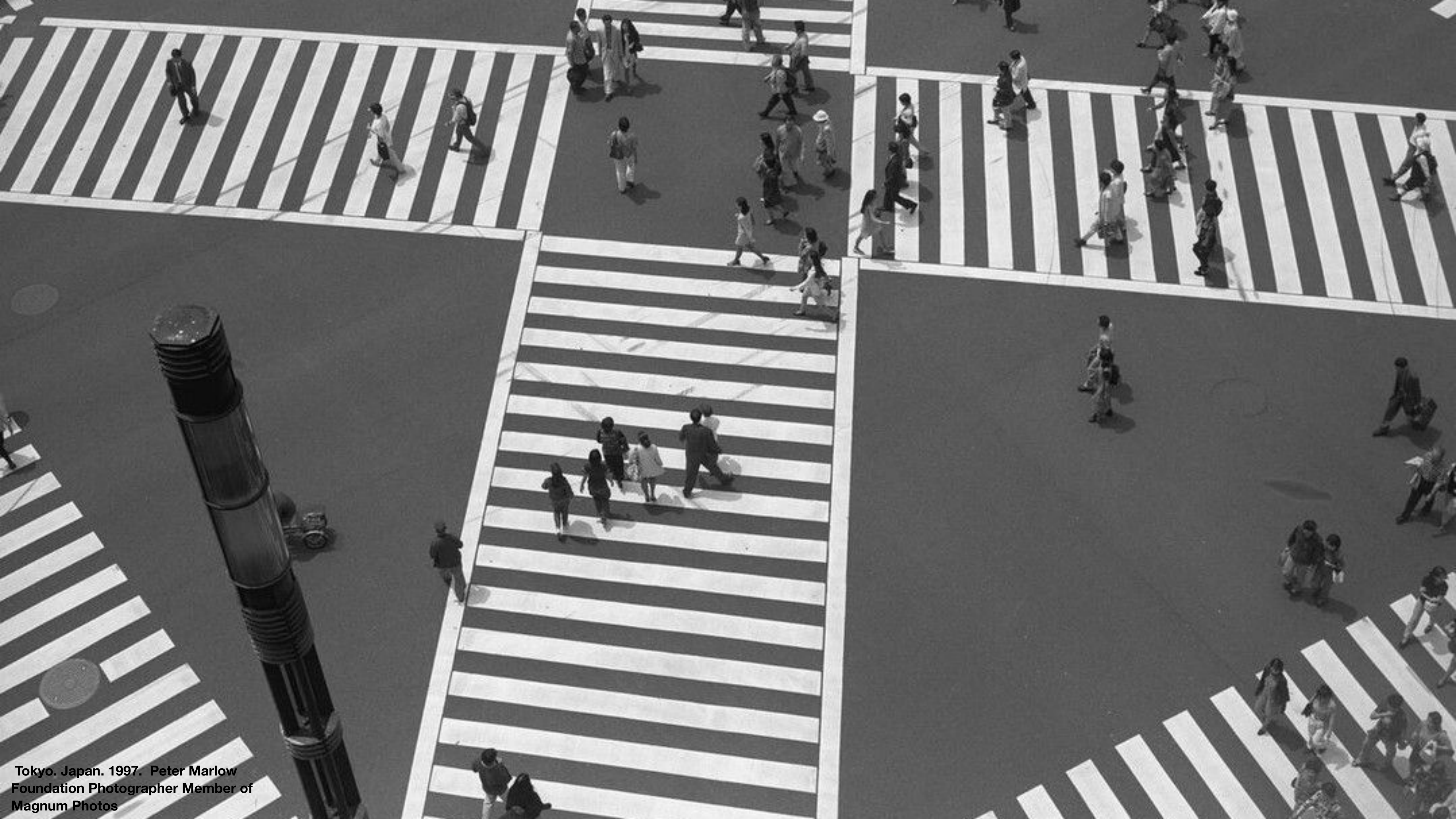
Tokyo, Japan. 1997.